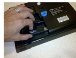
2b. Plug-in Wireless Adapter (if using internet)