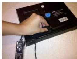
2a. Plug-in Phone Modem and Phone Cord