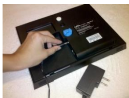
1. Plug-in Power Adapter

Just plug in the frame, attach the phone line and set it in a convenient location, such as a night stand, end table or kitchen counter. Now your loved one is ready to receive messages and photos.