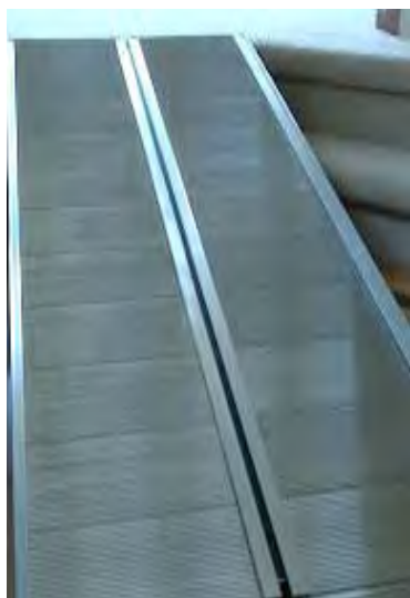
Features a no-pinch, non-protruding live hinge for safe, silent, and maintenance free operation

Introducing the new SUITCASE® Signature Series™ ramp. While similar in appearance and function to the faithful SUITCASE Classic Series ramp, the Signature Series version features several innovative design enhancements. From the no pinch, non-protruding full-length live hinge and durable, ergonomically designed handles to the enhanced extruded tread for superior traction, this ramp was redesigned from the ground up to be simply the best in the industry. Top Lip Extension (TLE) compatible. Available in 2' – 8' lengths with an 800-pound weight capacity.