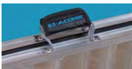
Ergonomically designed flexible, non-breakable handles offer convenient carrying and a comfortable grip